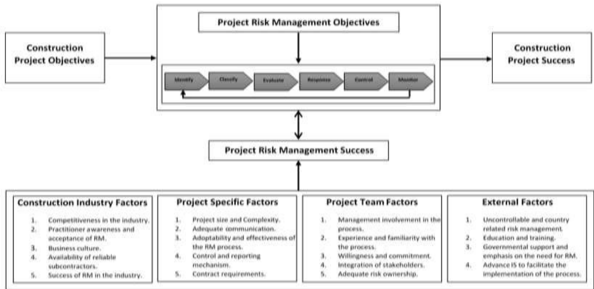
Figure 1. Critical success factors model for project risk management success.