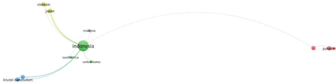
Figure 7 Network Visualization of Country Research.